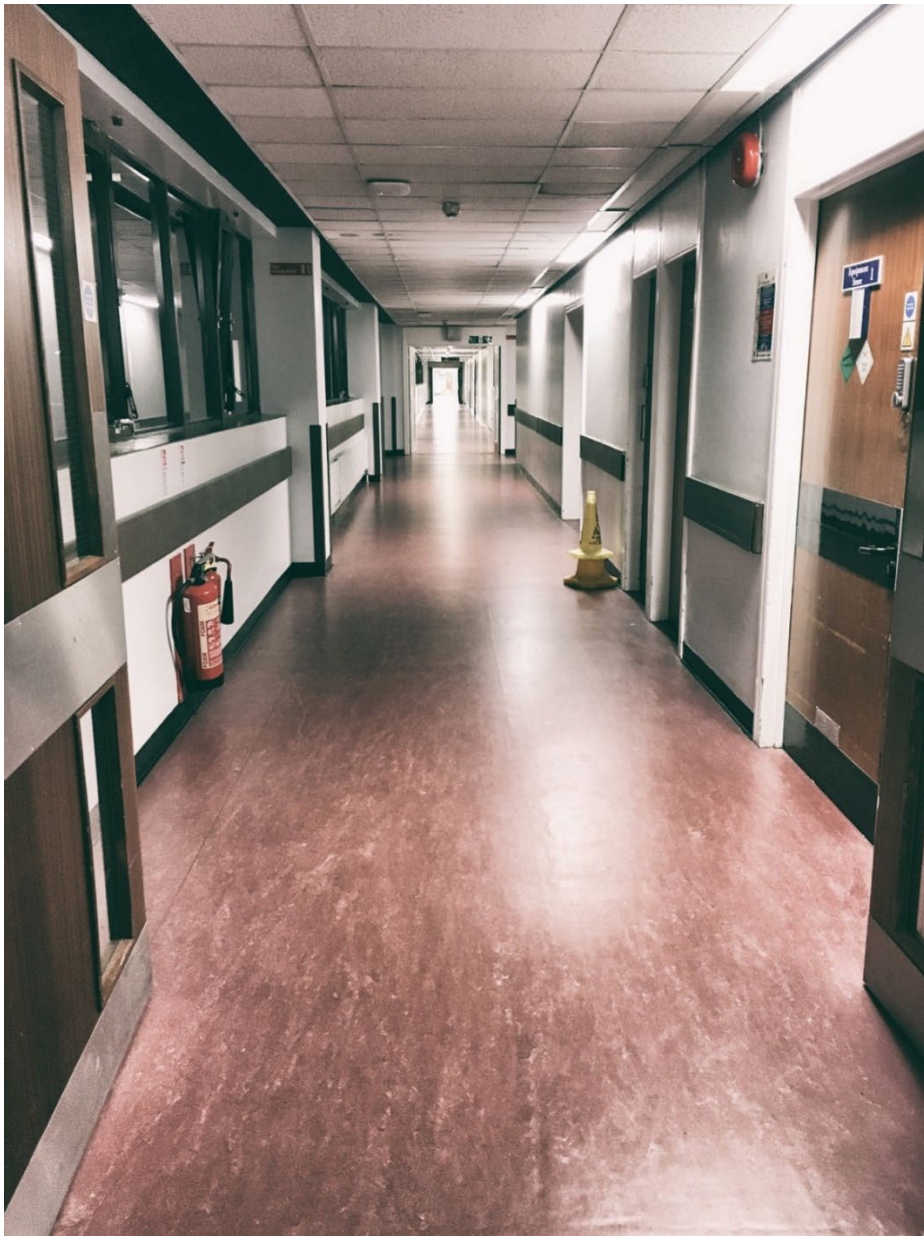
"Hospital Time Passes Slowly"