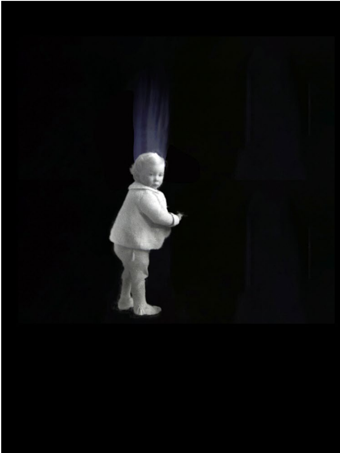
“Are You Coming?”